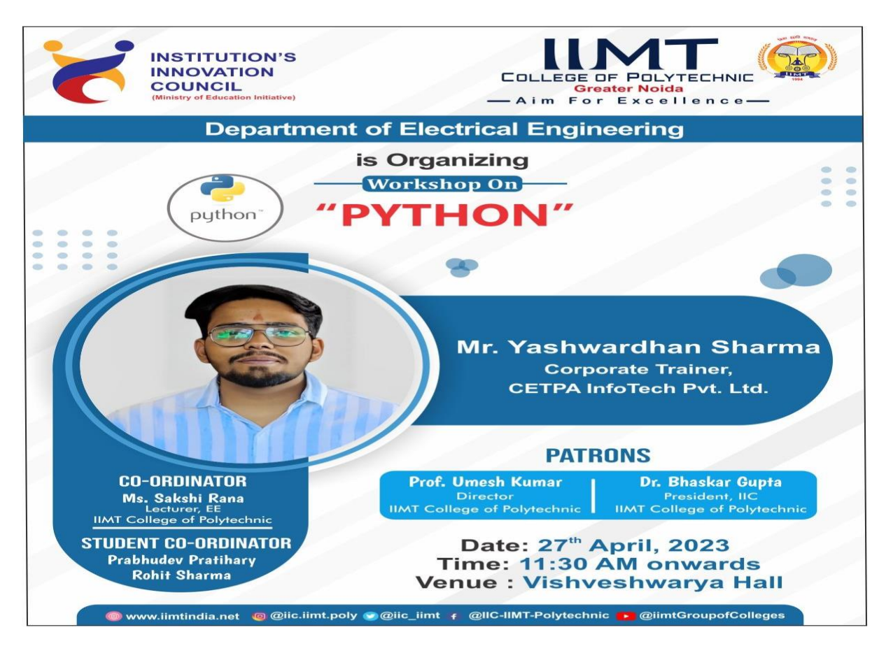
Fig: Creative of the Workshop

He gave a detailed introduction to and discussed its impact in our day- to- day life. The sessions held in the workshop were highly interactive and the participating faculty and students of the institute were greatly benefitted by the knowledge shared by the speaker.