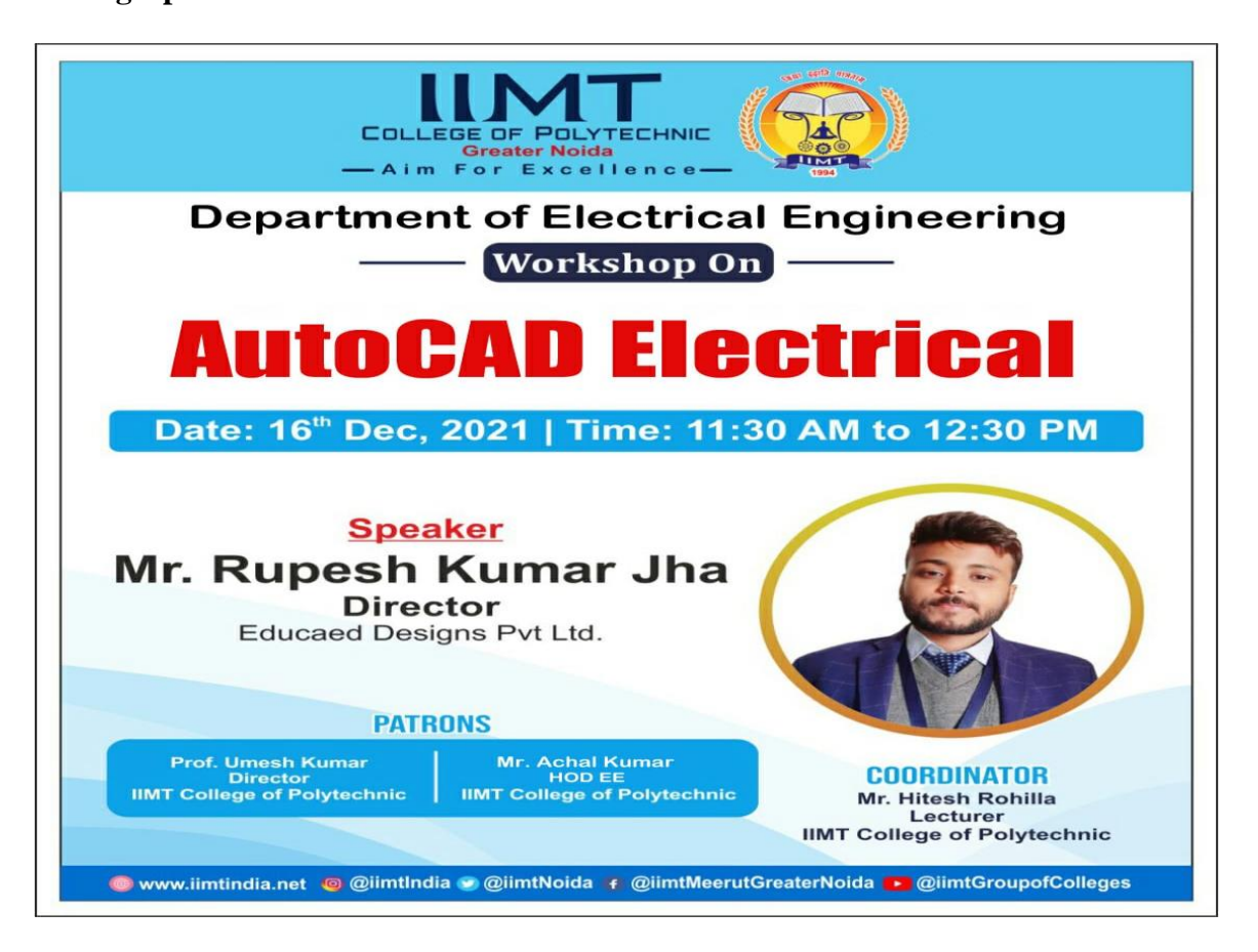
Fig: Creative of the Workshop