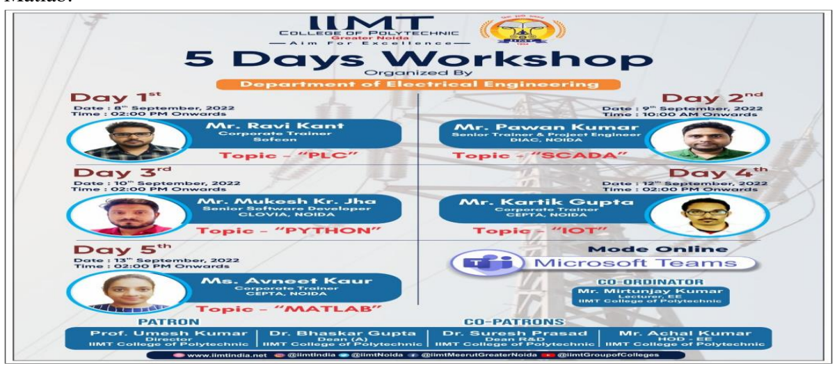
Fig: Creative of the Workshop

5. Ms. Avneet Kaur shared about the basic knowledge and discussed many tools used in Matlab.